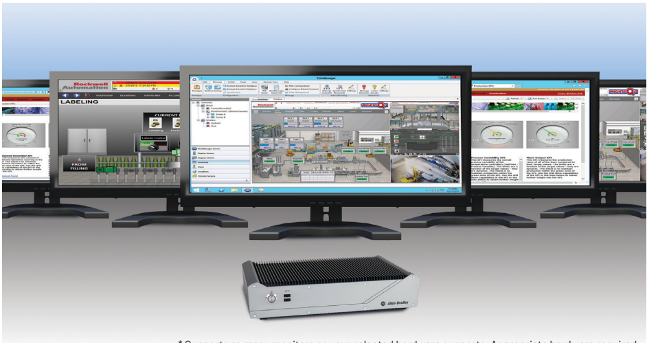
* Supports as many monitors as your selected hardware supports. Appropriate hardware required. Up to 7 monitors are supported by the VersaView 5200 Multi 4K display from Allen-Bradley pictured above.

Drive multiple<sup>*</sup> 4K monitors from a single thin client. Assign multiple applications and screen configurations to every monitor to ensure everything in your plant stays in view.